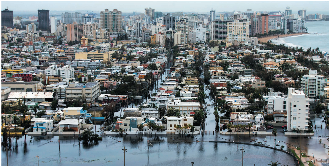
The coastal city of San Juan in Puerto Rico was flooded after Hurricane Maria hit in September 2017.